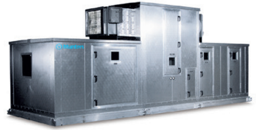
ICA Desiccant Dehumidifier with RightDry™

Munters ICA is available in multiple configurations capable of up to 100,000 cfm. This system includes a dehumidifier with options for nine rotor sizes, high performance heating and cooling coils, refrigeration package and supply and return HEPA filters. In addition, the system is NRTL approved to UL standards and is manufactured in an ISO 9001:2008 certified facility. The ability to use hot water, as low as 100°F, or low pressure steam as a regeneration source, allows for tight humidity control using an existing energy source, or recovered from a waste energy source.